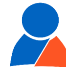
Weakness on one side of the body